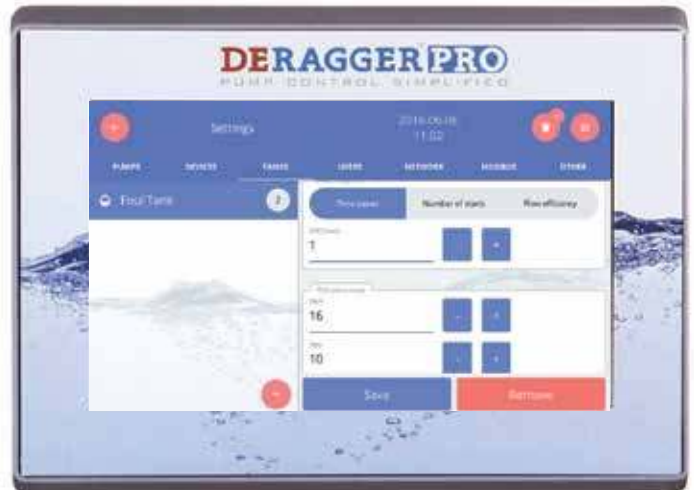
Tank Settings Screen

Takes minutes to configure rather than hours or days, using the intuitive interface via swipe touch screen similar to smart phone.