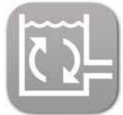
WET WELL CLEAN

Periodically cycles station to clear FOG and debris, eliminating 90+% of vactoring.