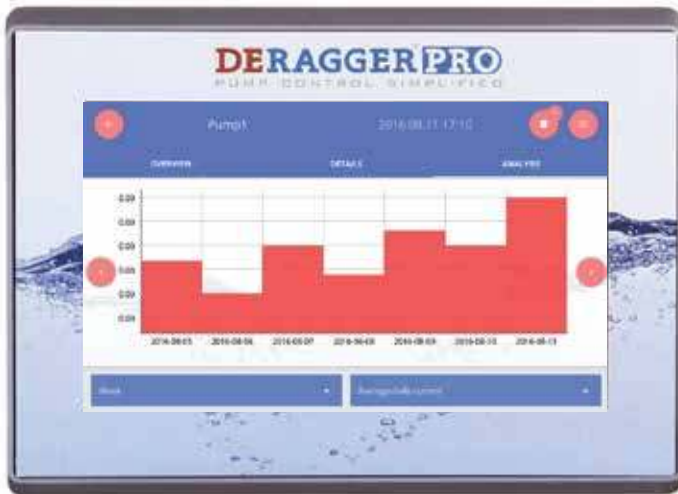
Pump Analysis Screen